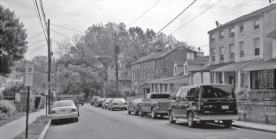
East Linden St., summer 2008.